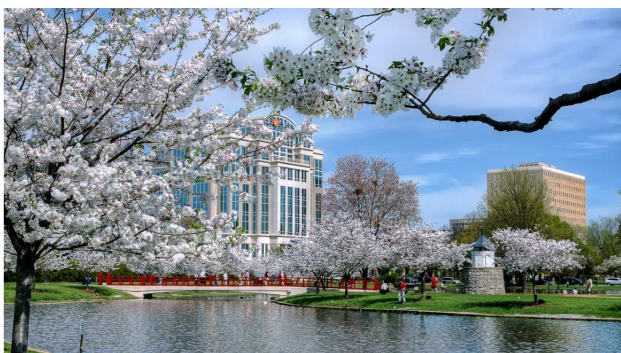
Big Spring International Park in Huntsville, Alabama.