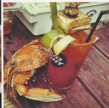
BOONES BAR'S BLOODY MARY

FOR MORE INFORMATION: PUBTOURCHARLESTON.COM (843) 577-5535