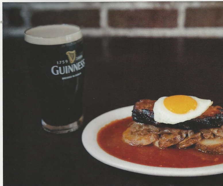
TOMMY CONDON'S RESTAURANT - STEAK N' EGGS

FOR MORE INFORMATION: RESTORATIONONKING.COM (877) 221-7202