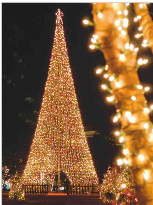
CHARLESTON AREA CVB

There's an organized tour for practically everything in Charleston. New options include Free Tours by Foot – a “pay what you like” tour company ( www.freetoursbyfoot.com ) – and Your Call Private Boat Tours ( www.privateharbortours.com ). Bulldog Tours ( www.bulldogtours.com ) offers a variety of Charleston tours, including a special Holiday Walking Tour starting Dec. 1. — LS