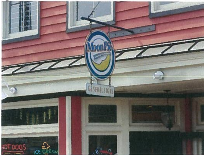
This photo of MoonPie General Store is courtesy of TripAdvisor

23. Snack-cake-scented candles at MoonPie General Store