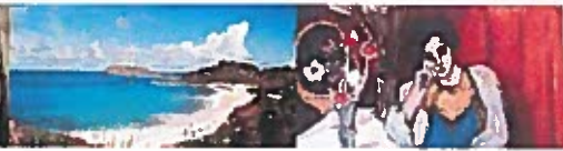
10 THINGS YOU DIDN'T KNOW ABOUT SEERSUCKER