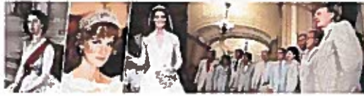
8 BEAUTY SECRETS STRAIGHT FROM ROYALTY