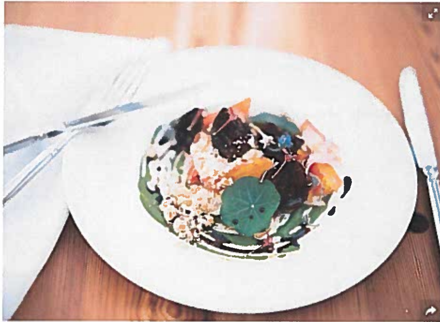
Cannon Green (above)