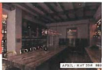
APRIL / MAY 2016 $03

Saint Simons Island, Georgia Uniquely distinct, Saint Simons Island is a beautiful and relaxing coastal town. The beach is perfect for family vacations and is a great place to visit with friends. The town is a mix of old and new, and the atmosphere is just what you need to relax and enjoy the sun. www.saintsimons.com