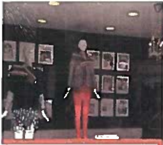
Hampton is a unique shopping experience that caters to every individual customer