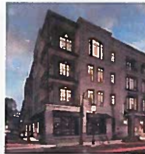
The George Gallery is a little corner gallery with a lot of personality. They have regular openings so check their website for events while you're in town!

Restoration on King is a boutique hotel that is located right on Charleston's famous King Street. Newly expanded and renovated, the Restoration is no doubt in a prime Charleston location. For an added special touch, the Restoration's staff delivers breakfast every morning in a charming picnic basket to every guest's room.