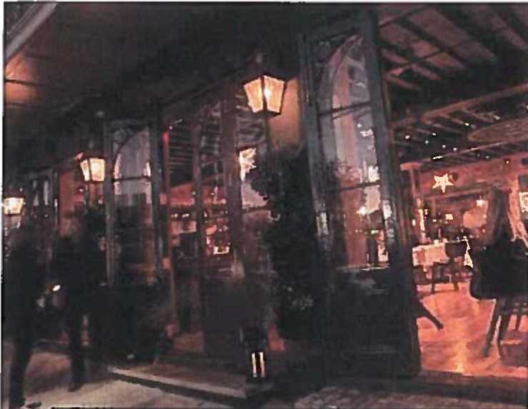
One of the chicest new restaurants in Charleston. Anson hosts an elegant meal and a fantastic wine list.