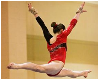
33rd Annual Charleston Cup Gymnastics Meet @ Charleston Area Convention Ctr, 2/25-2/27