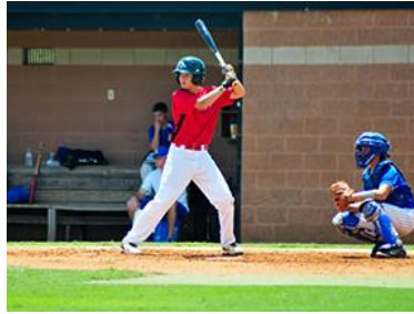
Swig & Swine Youth Classic - NCAA D1 @ Shipyard Park, 2/25-2/27