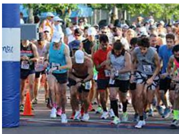
2nd Annual Sweetgrass 1/2 Marathon @ Park West & Carolina