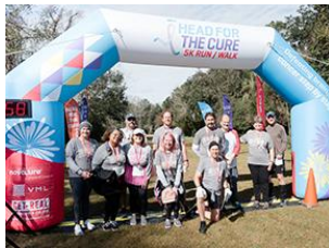
Head for the Cure 5K Charleston @ Wannamaker County Park, 2/26