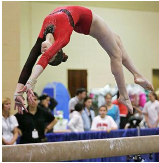
Charleston Sports Commission