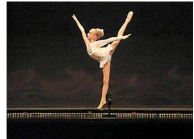
Inferno Dance 2022 @ Kiawah Island Golf Resort, 2/25-2/27