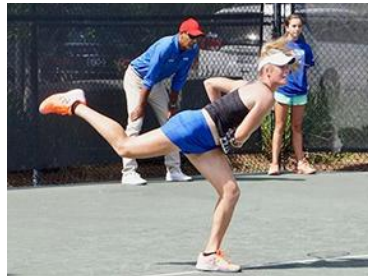
LTP @ Daniel Island Tennis Center Junior Championship L5 12U-18U @ LTP - DI, 2/25-2/27