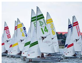
Phebe Corckran King Women's Team Race @ CofC Walker