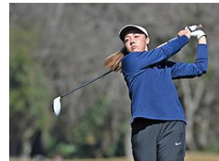
RiverTowne Invitational Collegiate Golf @ RiverTowne CC, 2/28-3/1