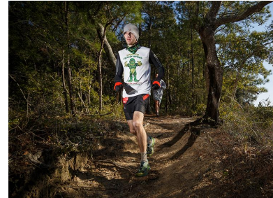
Almost 9 Miler Endurance Race @ The Biggin Creek Trail, 2/26