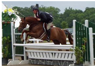
SC Dressage & Combined Training Association Horse Show @ Mullet Hall Equestrian Center, 2/26-2/27