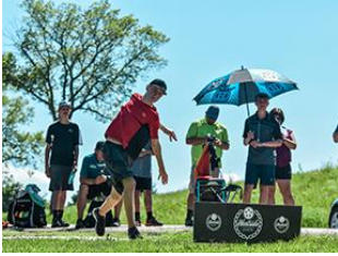
The Next Tournament from Lowcountry Disc Golf @ James Island County Park, 5/27