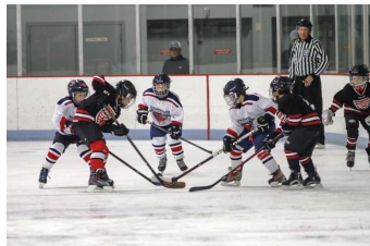
TCS Hockey's SC Memorial Cup Youth Hockey Tournament @ Carolina Ice Palace, 5/26-5/29