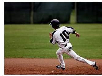
Game Day USA - Salute to Service Baseball Tournament @ Shipyard Park, 5/26-5/28