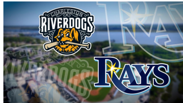
CHARLESTON RIVERDOGS Next home series against Augusta, 5/31-6/4.