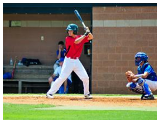
Diamond Devils Memorial Day Baseball Tournament @ North Charleston & Moncks Corner Fields, 5/27-5/29