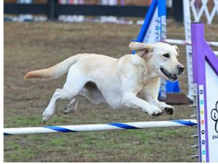
LCDA Trial @ Lowcountry Dog Training Field, 5/26-5/28