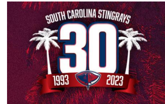
SC STINGRAYS Stingrays releases 2023/24 schedule. Home opener on 10/21/23.