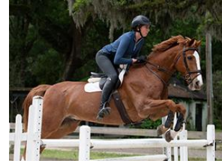
SCDCTA Dressage/CT Schooling Show @ Middleton Place, 5/27