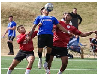
3rd Annual Carolina Cup Adult 8 v 8 Soccer Tournament @ James Island Soccer Complex, 5/26-5/28