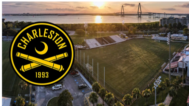
CHARLESTON BATTERY Three Match Pack for 3 games in June, only $41! Next home match-up with Indy, 6/2.