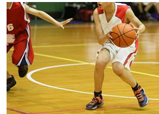
Port City Memorial Shootout Basketball Tournament @ North Charleston Athletic Center, 5/26- 5/28