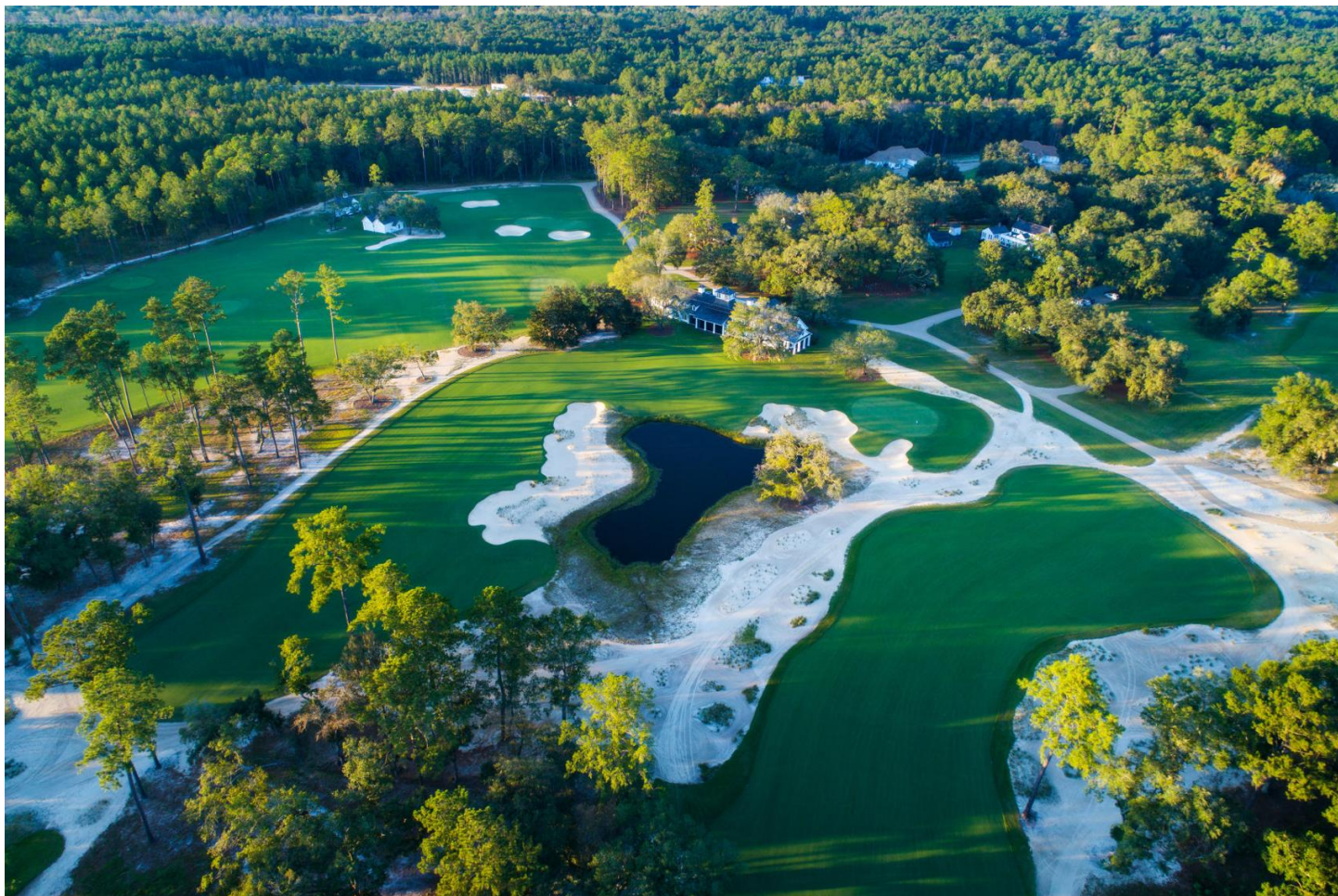
An Aerial view of the Congaree clubhouse and finishing holes on the course located in Ridgeland, S.C.