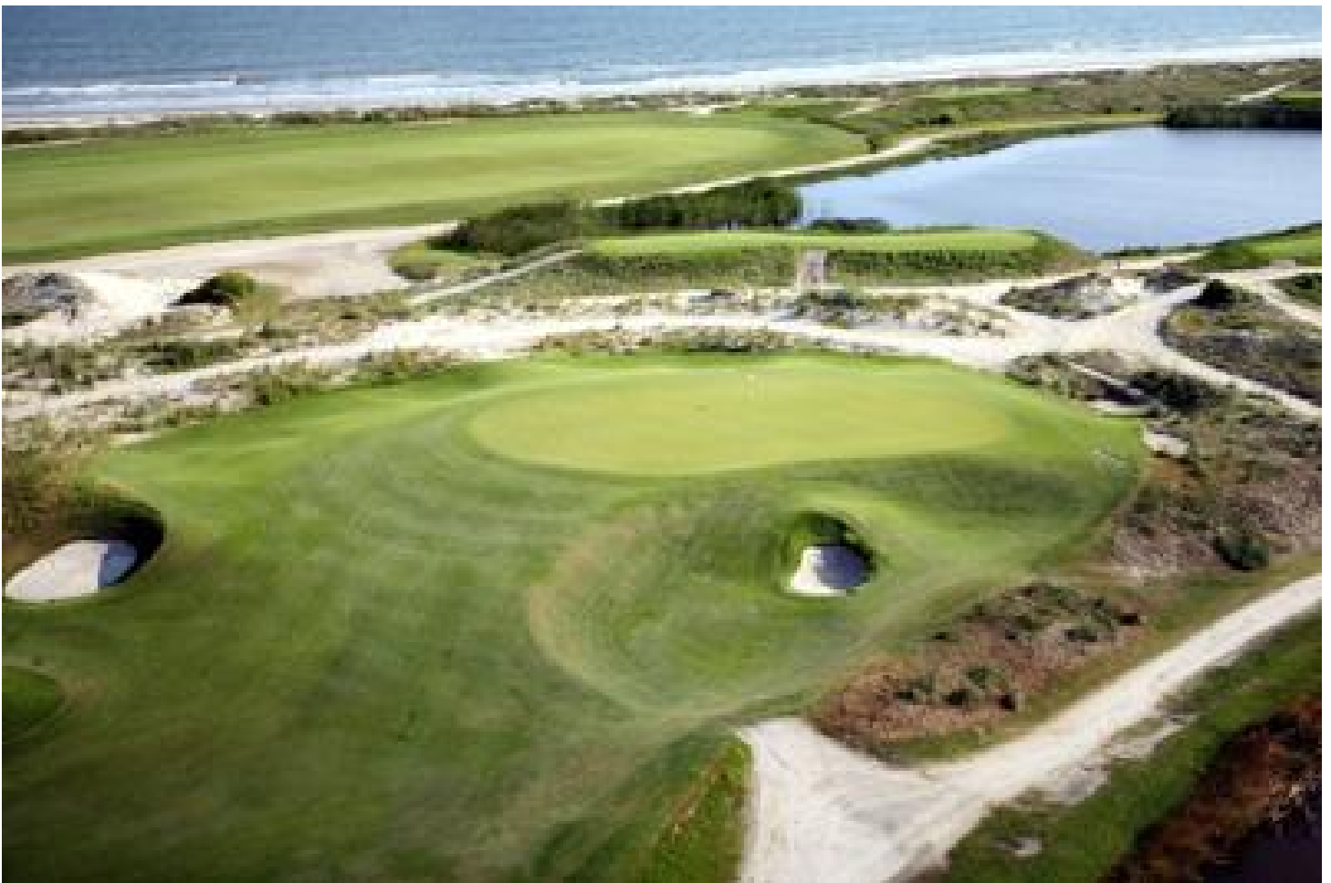
KIAWAH'S OCEAN COURSE NO. 1 IN GOLFWEEK'S RANKINGS OF SC GOLF COURSES YOU CAN PLAY

Former Clemson golfer from Mount Pleasant returning to PGA Tour