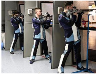
Southern Conference Rifle Championships by The Citadel @ Inouye Marksmanship Center, 3/2-3/3.