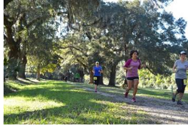
13th Annual Where the Wild Things Run 5K @ Caw Caw Interpretive Center, 3/2.