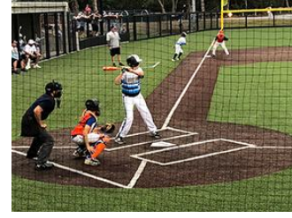
Shipyard/PBR Showdown HS Teams and SP#YouthShowdown Baseball Tournaments @ Shipyard Park, 2/29-3/3.