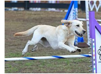
USDAA Low Country Dog Agility Trial by LCDA @ Lowcountry Dog Training Field, 3/1-3/3.