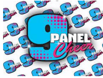
Low Country Showdown 2024 by 9 Panel Cheer @ Charleston Area Convention Ctr, 3/2-3/3.