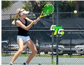
Rally to the Slam Adults Tennis Tournament by CTC @ Wild Dunes Resort, 3/1-3/2.