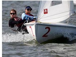
Phebe Corckran King Women's Team Race Sailing @ CofC Walker Center, 3/2-3/3.