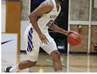
29th Annual Jim Ryckman 3v3 Senior Basketball Tournament @ Mt. Pleasant Town Hall Gym, 3/2.