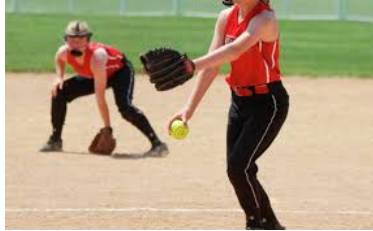
USSSA Southeast Sports Best of the Best Fastpitch Softball: July 25-26