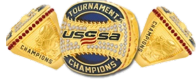
End of Summer Finale Baseball: July 25-26