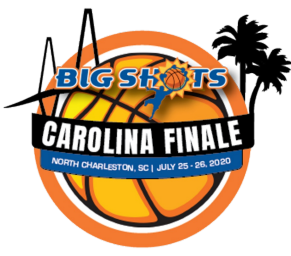
BIG SHOTS AAU Carolina Finale (17U-9U, B/G): July 25-26