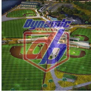
Dynamic Baseball End of Summer Championship- South: July 23-26