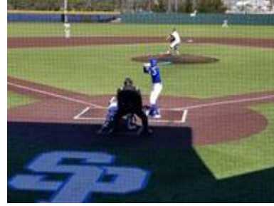
SP #22 - Shipyard Park Tournament Series: July 23-26