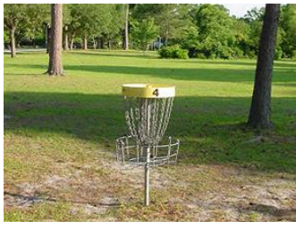
King of Wannamaker presented by Mint Discs @ Wannamaker County Park, 7/16