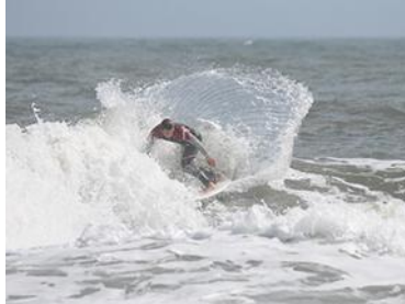
55th Annual The D.J. McKeelin Gromfest @ Folly Beach Washout, 7/16