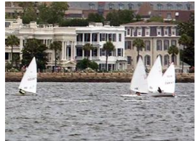
86th Annual Charleston Yacht Club Open Regatta @ CYC, 7/15-7/17