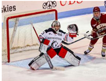
Southern Prospects Girls Hockey Camp @ Carolina Ice Palace, 7/21-7/24