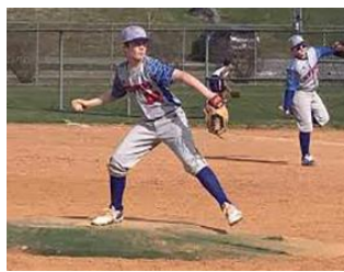
Game Day USA - Battle for the Ship #3 (9U-14U) @ Shipyard Park, 7/14-7/17