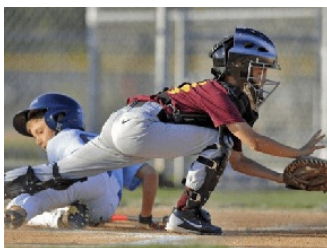
CABA 17U Wood Bat World Series @ Charleston Area Baseball Fields, 7/17-7/21