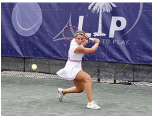
USTA Girls '18 National Clay Court Championships @ LTP Mt. Pleasant, 7/9-7/17