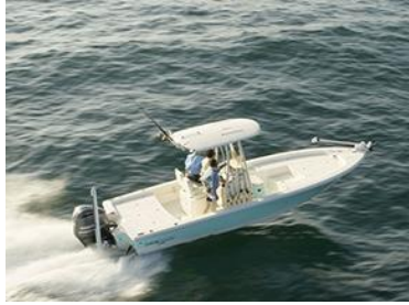
3rd Annual Hooked on Miracles King Mackerel Tournament @ Ripley Light Yacht Club, 7/14-7/16