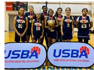
USBA National Girls Basketball Championships @ Charleston Area Facilities, 7/13-7/16