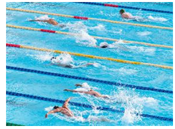
SCS LC Senior State Championship @ North Charleston Aquatic Center, 7/14-7/17