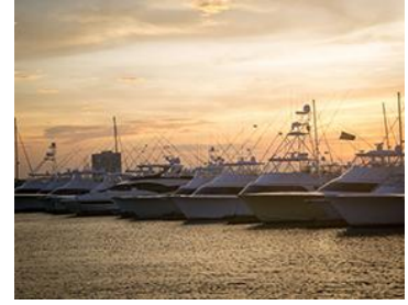
Edisto Invitational Billfish Tournament @ Edisto Beach, 7/20-7/23