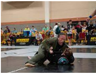
New Breed Jiu Jitsu Charleston Summer Championship @ Charleston Area Convention Center, 7/16-7/17