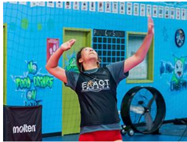
Exact Sports Volleyball Showcase Camp Charleston @ North Charleston Athletic Center, 7/17