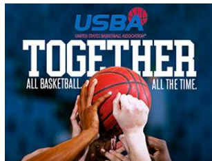
USBA National Boys Basketball Championships @ Charleston Area Facilities, 7/12-7/16