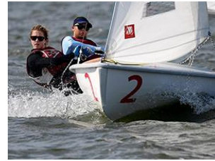
Bob Bavier Team Race Invitational Sailing @ Walker Sailing Complex, 3/9-3/10.