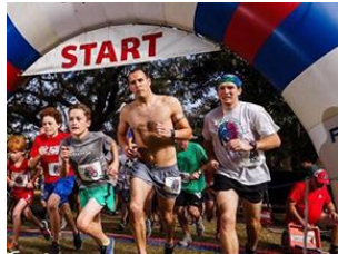
Peyton's Wild and Wacky 5K Ultra (50K, 5K) @ Laurel Hill Park, Mt. Pleasant, 3/9.