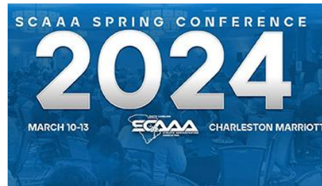
SC Athletic Administration Association Conference @ Charleston Marriott, 3/9-3/13.