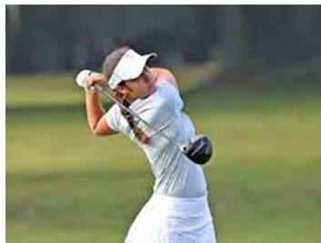
Briar's Creek Invitational Women's College Golf Hosted by CofC @ Briar's Creek Club, 3/11-3/12.