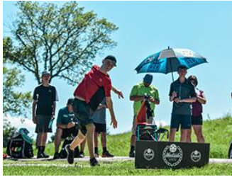
Sewee Disc Jam Disc Golf Tournament @ Sewee Outpost, Awendaw, 3/9.