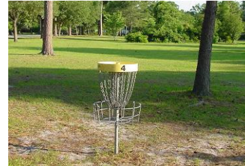
Tournament 26 Disc Golf @ James Island County Park, 3/9.