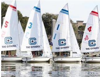
2nd Annual Turner Team Sailing Race by The Citadel @ Daniel Island Yacht Club, 3/9.