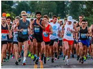
Catch the Leprechaun 5K by Blue Sky Endurance @ Carolina Park, 3/14.